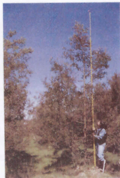
Figure 9. Black wattle (Bodalla Provenance) in trial at Kowen ACT—5.6 m tall at 34 months.