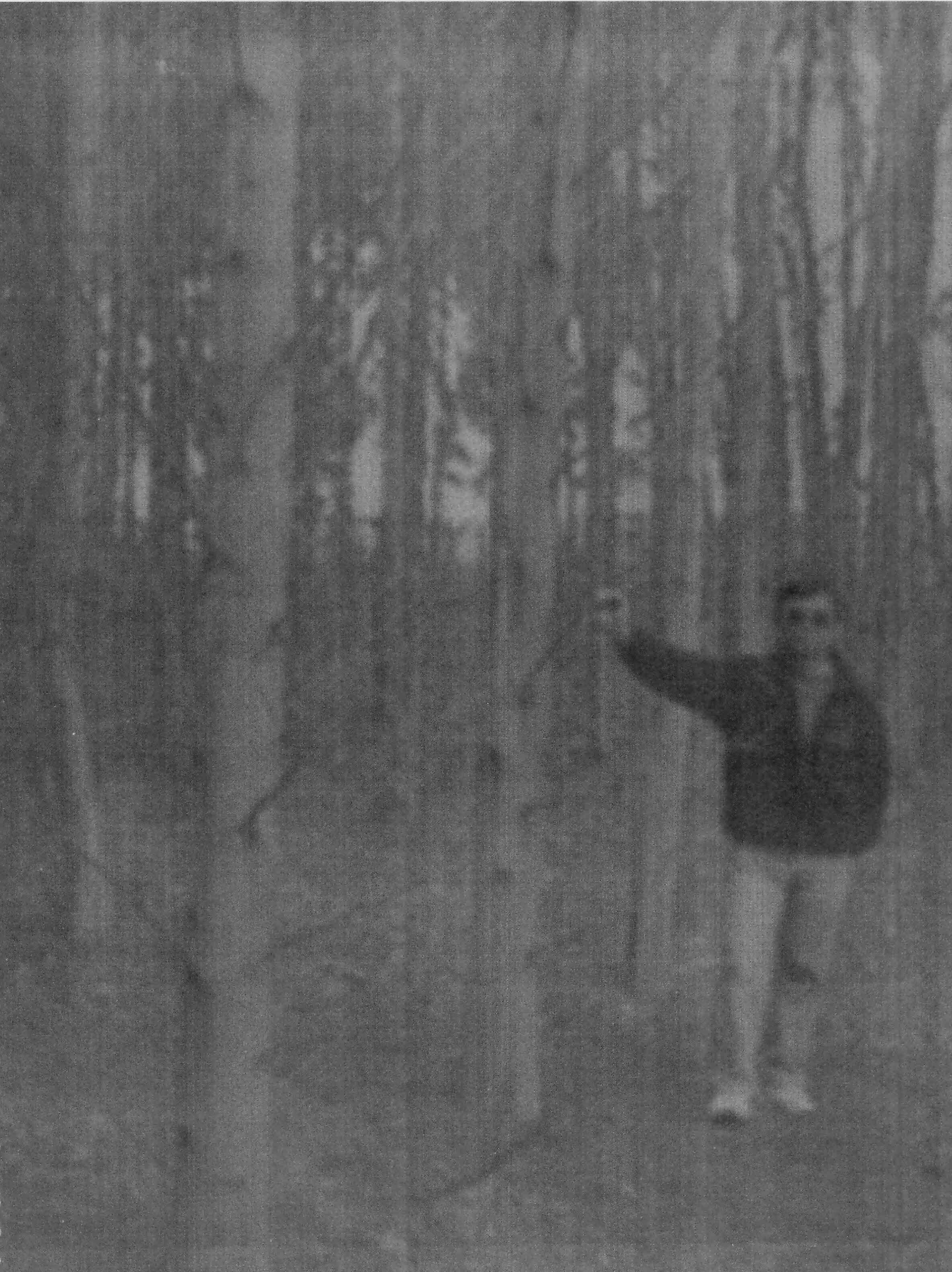
Back cover, bottom photograph