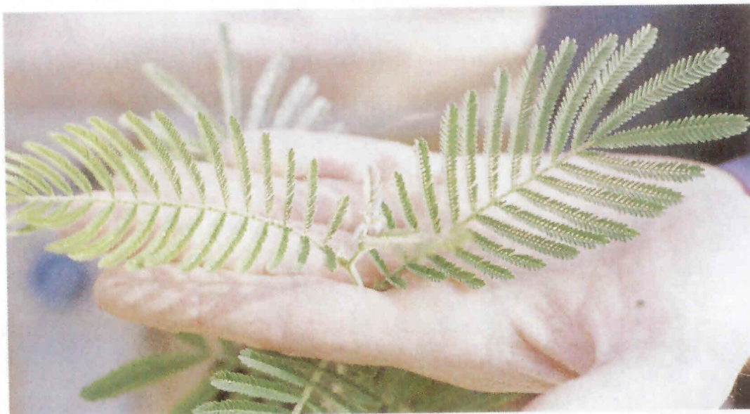
Figure 2. Black wattle foliage.

Black wattle ( A. mearnsii ) is typically a large shrub or small tree and grows 6–20 m in height. Of the c. 950 acacia species naturally occurring in Australia, it is one of only 81 that have adult bipinnate foliage. Of the c. 950 acacia species naturally occurring in Australia, it is one of only 81 that have adult bipinnate foliage (Phillip Kodela Royal Botanic Gardens Sydney pers. comm. 2000). Often described as short-lived (15–20 years), black wattle has been reported to live more than 40 years on favourable sites.