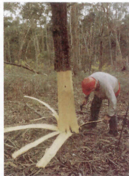
Figure 7. Neville Gray strips black wattle for bark near Elmhurst, Victoria.

Wattle tannin extract is also used as a preservative for fishing nets, ropes and sails (Sherry 1971) and to prevent corrosion of iron (mild steel and cast iron) in radiators, water-cooling and steam boiler systems (Moresby 1996). It is used in a conditioning agent for drilling mud; as a calcite depressant in ore flotation, a surface coating for wood, and in combination with ethanolamine and formaldehyde, as a flocculent to purify water supplies (Wu Zaisong 1997).