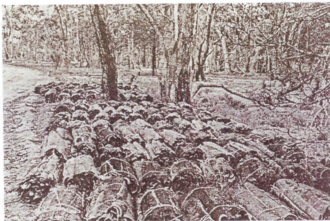
Figure 4. Black wattle bark stacked for drying near Woolpoor, Stawell Forest District, Victoria in 1965.

Natural stands of black wattle were harvested from the 1820s to supply tannin-rich bark to Australian and European tanneries. This once large bark industry all but disappeared, with a couple of exceptions, by the 1970s (Searle 1991). Today the Greenhalgh Tannery (Haddon, Victoria) is the last tannery in Australia to use bark stripped from natural stands of black wattle. This family-owned tannery has been in continuous operation since 1865 and now uses about 80 tonnes of bone-dry bark per year. The bark is used to tan Hereford bullock hides for saddlery (Jack Greenhalgh pers. comm. 1996). Joshua Pitt Pty Ltd (Northcote Melbourne Victoria) is another family-owned tannery and has been in continuous operation since 1892. It produces sole leather, football shoe leather, cricket-ball and waste-belt leather using imported tannin extract (Robert Pitt pers. comm. 1996). Elsewhere in Australia, tanneries use chrome tannins.