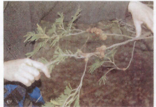
Figure 11. Rust gall fungus ( Uromycladium tepperianum ) on black wattle.

Perhaps the most obvious disease on black wattle is the rust gall fungus ( Uromycladium tepperianum ). This causes large, hard, brown, irregular knobs to form on the small outer stems of the crown and developing fruits. In severe attacks the whole canopy may be covered with these galls. Such heavy infestations weaken the plant, reduce its leaf canopy, inhibit seed production or may even kill a tree (Jones & Elliott 1995).