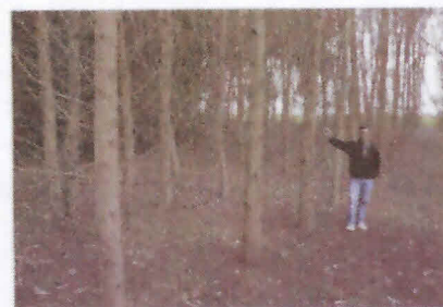
Figure 8. Black wattle (Omeo Highway Provenance) growing in CSIRO Scrimber trial near Mt Gambier South Australia (782mm/annum rainfall). Planted May 1991 and photographed in September 2000.

Black Wattle is an adaptable, moderately drought and frost tolerant species (down to about -5^{\circ}\text{C} ) that grows well across a range of soil types, from the temperate and subtropical lowlands to tropical highlands. However it does not grow well on waterlogged or