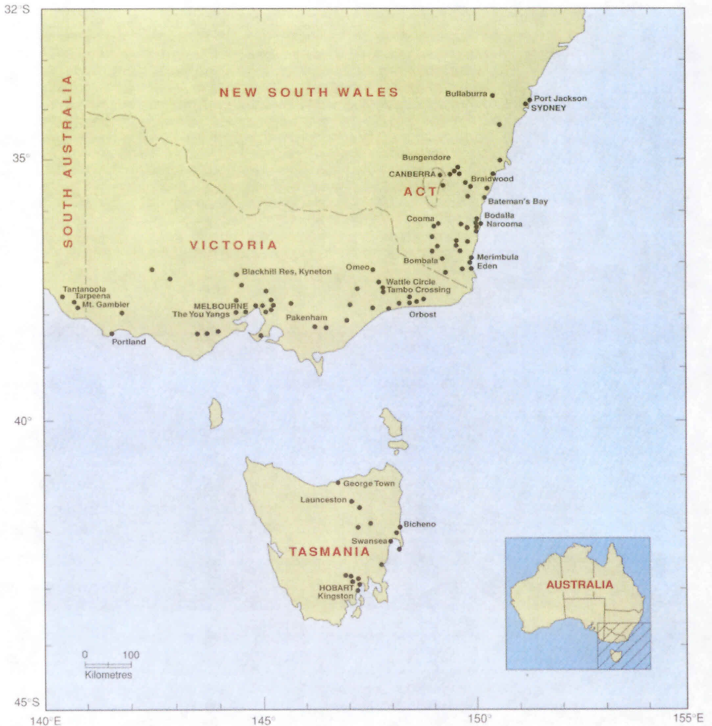
Figure 3. Map showing the natural distribution of black wattle as indicated by collection locations of herbarium specimens and seed.